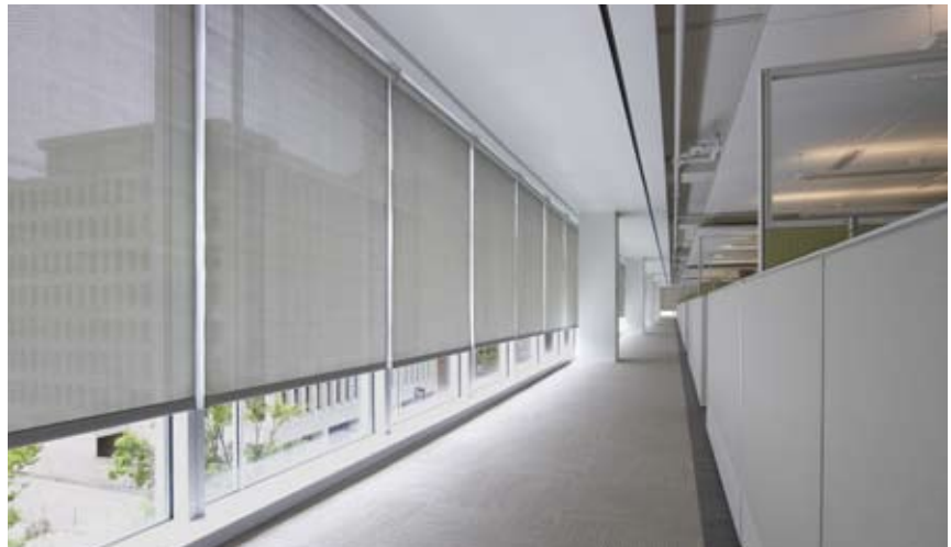
U.S. Green Building Council Headquarters, Washington, D.C., WDG Architecture, interior: Envision Design