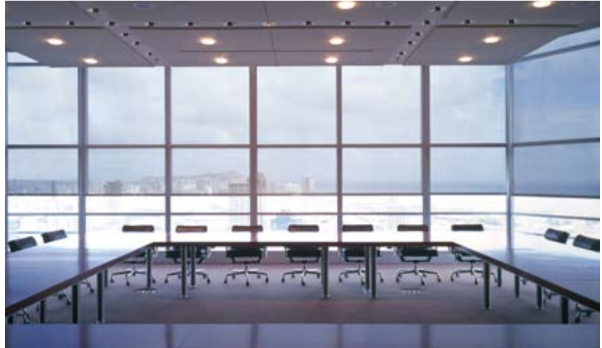
First Hawaiian Bank Tower, Honolulu, Hawaii, interior: Gensler

Please contact MechoSystems for complete warranty information.